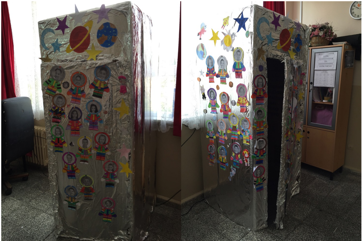
Figure 2: A Sample Classroom Activity: Building a Time Machine